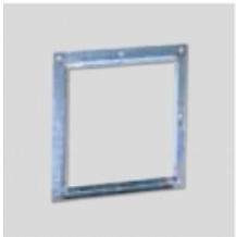
Outlet flange CBM